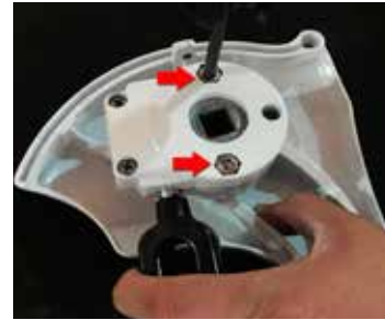
② Place the Cassette cover Gear Box set on a flat surface. Remove the 2 bolts from the Gear Box by using a size 3/16 Hex Key.