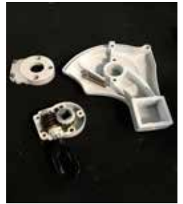
⑤ Remove the Gear Box cover. Keep all parts intact.