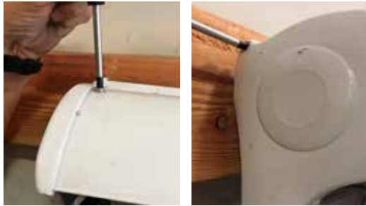
① L Series Only: Unscrew the 3 screws to remove the Cassette cover from the Cassette.