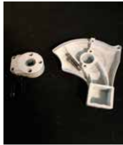
③ Remove the Gear Box from the Cassette cover. Lay the Gear Box on a flat surface.