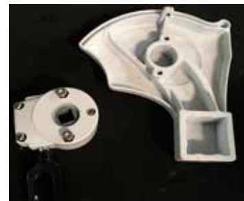
⑥ Lubricate the Gear Box threads. Place the Gear Box cover back on and secure with 3 screws.