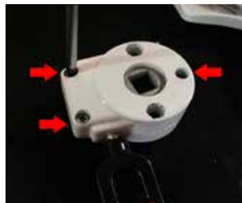
④ Unscrew the 3 screws from the Gear Box with a screwdriver.